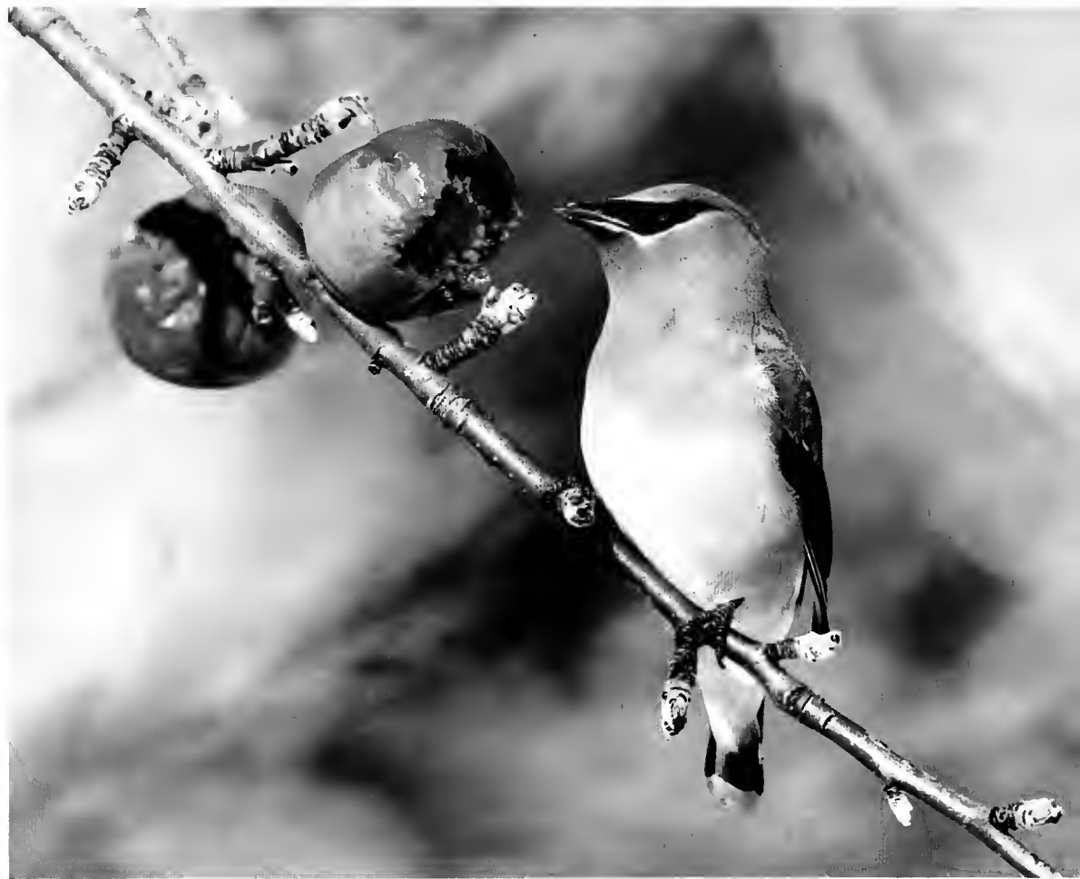
Cedar waxwing

“50 Years Restoring America’s Wildlife 1937-1987” a publication of the U.S. Department of the Interior, Fish and Wildlife Service